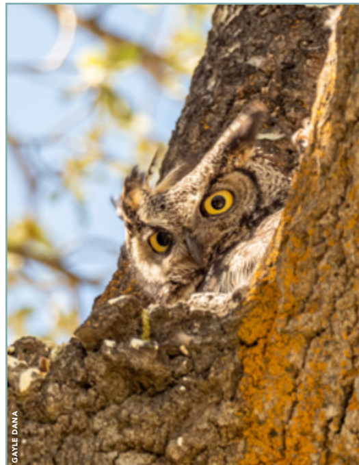
Look up in the trees while you're exploring our beautiful watershed—you might be lucky enough to spot a Great Horned Owl!

Contact Sue Drake at 530.550.8760 x5 or sdrake@truckeeriverwc.org.