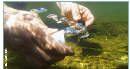
Adopt-A-Stream volunteer collects a water sample to be tested for various watershed health parameters.

Contact Eben Swain at 530.550.8760 x7 or eswain@truckeeriverwc.org