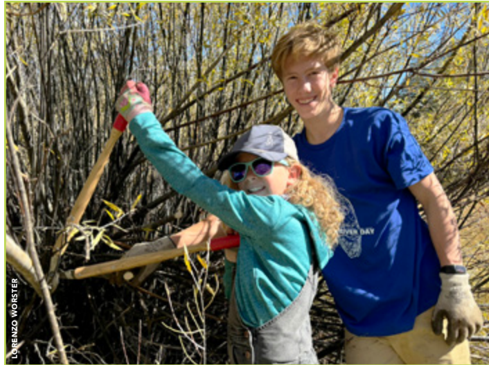
Donner Lagoon: Swing —but don't miss! Volunteers pound in willow stakes to reinforce the streambank. A Group Leader and volunteer take willow cuttings to be used for planting and making willow wattles.