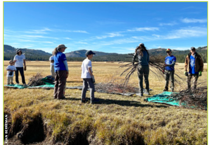
Lower Lacey Meadow: It takes all of us to get the work done! Volunteers come together to collect willow cuttings and make debris jams and willow wattles.

Thank you to our funders who make all this work possible: Donors of Truckee River Watershed Council, Truckee Chamber of Commerce, Town of Truckee, Truckee Tahoe Community Foundation, California Department of Fish and Wildlife, California State Water Resources Control Board, California Wildlife Conservation Board, Community Foundation of Northern Nevada-Truckee River Fund, and The Martis Fund.