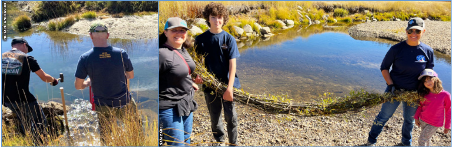
WASHESHU CREEK Driving it home. Hardworking volunteers improve stream and meadow hydrology by constructing debris jams that slow and stabilize flows.