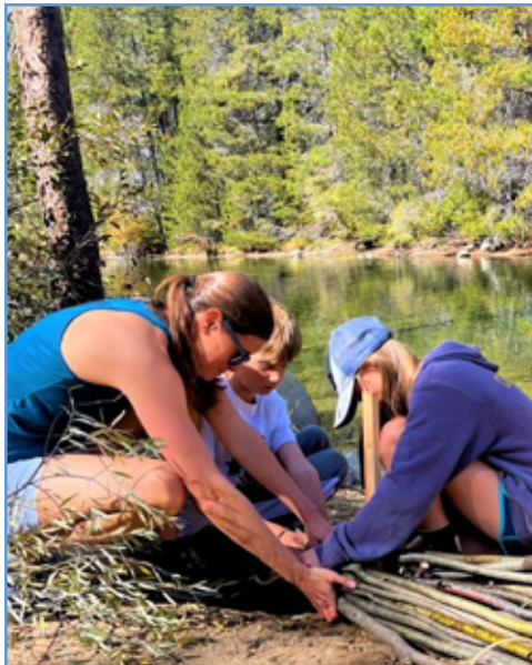
DONNER LAKE LAGOON Volunteers of all ages construct willow wattles, cinching away to stabilize the banks of Donner Lake Lagoon.

In partnership with California State Parks, volunteers spread native seed and mulch to re-establish riparian plants and prevent erosion of nutrient-rich topsoil, and they planted willows to protect and reinforce the streambank.