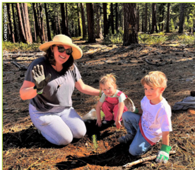
A multi-generational approach to restoring native Sugar Pines in our forested ecosystems at Sawtooth.

All the dirt on what makes the TRWC community and restoration volunteers so amazing!