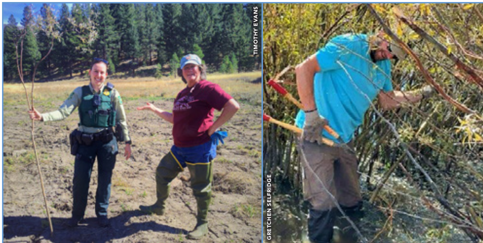
LOWER HOKE MEADOW LEFT: Vested volunteers stake a claim to improving watershed health. RIGHT: All caught up in the... willows? Volunteer twisted in revegetation and erosion control.