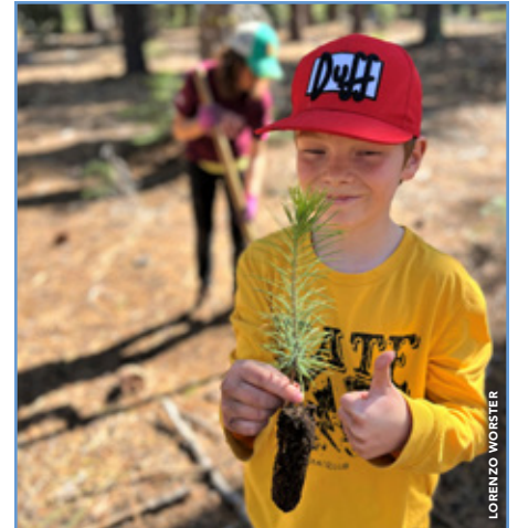
SAWTOOTH TREE PLANTING Thumbs up to restoring forest species diversity in the Truckee River Watershed!

In partnership with the Sugar Pine Foundation and the Tahoe National Forest, volunteers planted a diverse mix of native pine trees to improve forest resiliency.