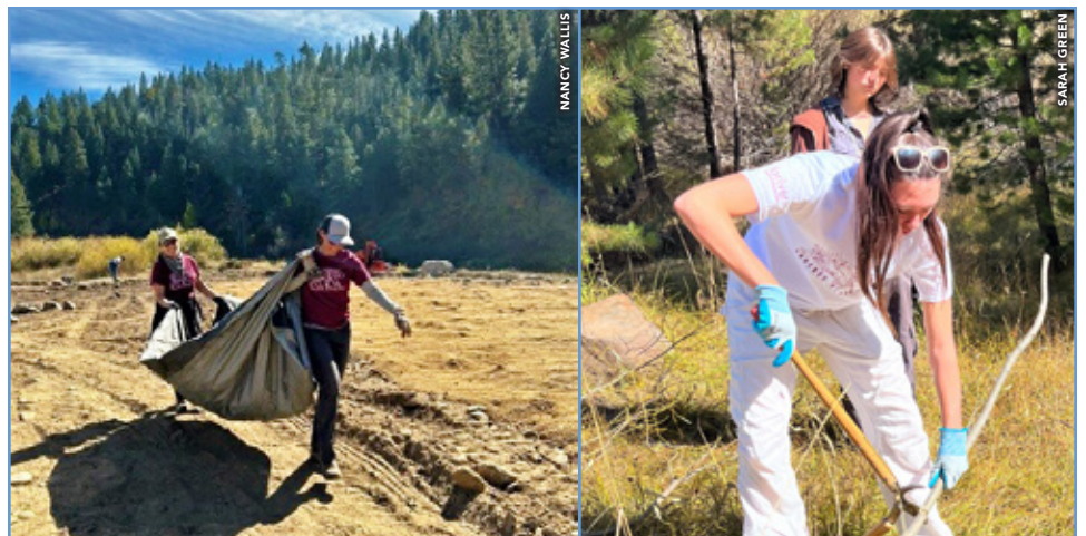
TRUCKEE RIVER WILDLIFE AREA: BOCA UNIT In it for the long haul. Our group leaders transport willow trimmings to cover freshly seeded streambanks.

In partnership with Olympic Valley Watershed Alliance and Trout Unlimited, volunteers improved woody debris jams along WaSheShu Creek and planted willows to stabilize eroding streambanks.