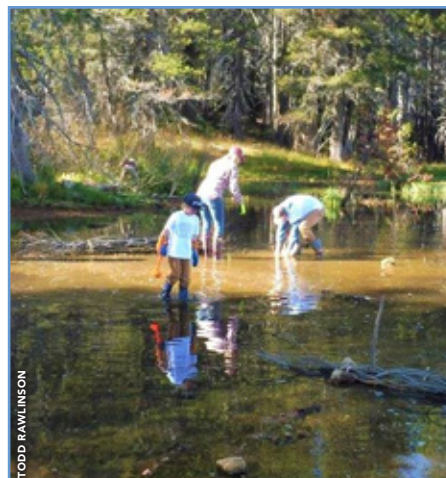
VAN NORDEN MEADOW Volunteers stabilize headwater stream banks with willow wattles.

In partnership with South Yuba River Citizen's League (SYRCL), volunteers built woody debris jams to slow high flows during snowmelt and spread water across the meadow to support meadow and wetland vegetation.