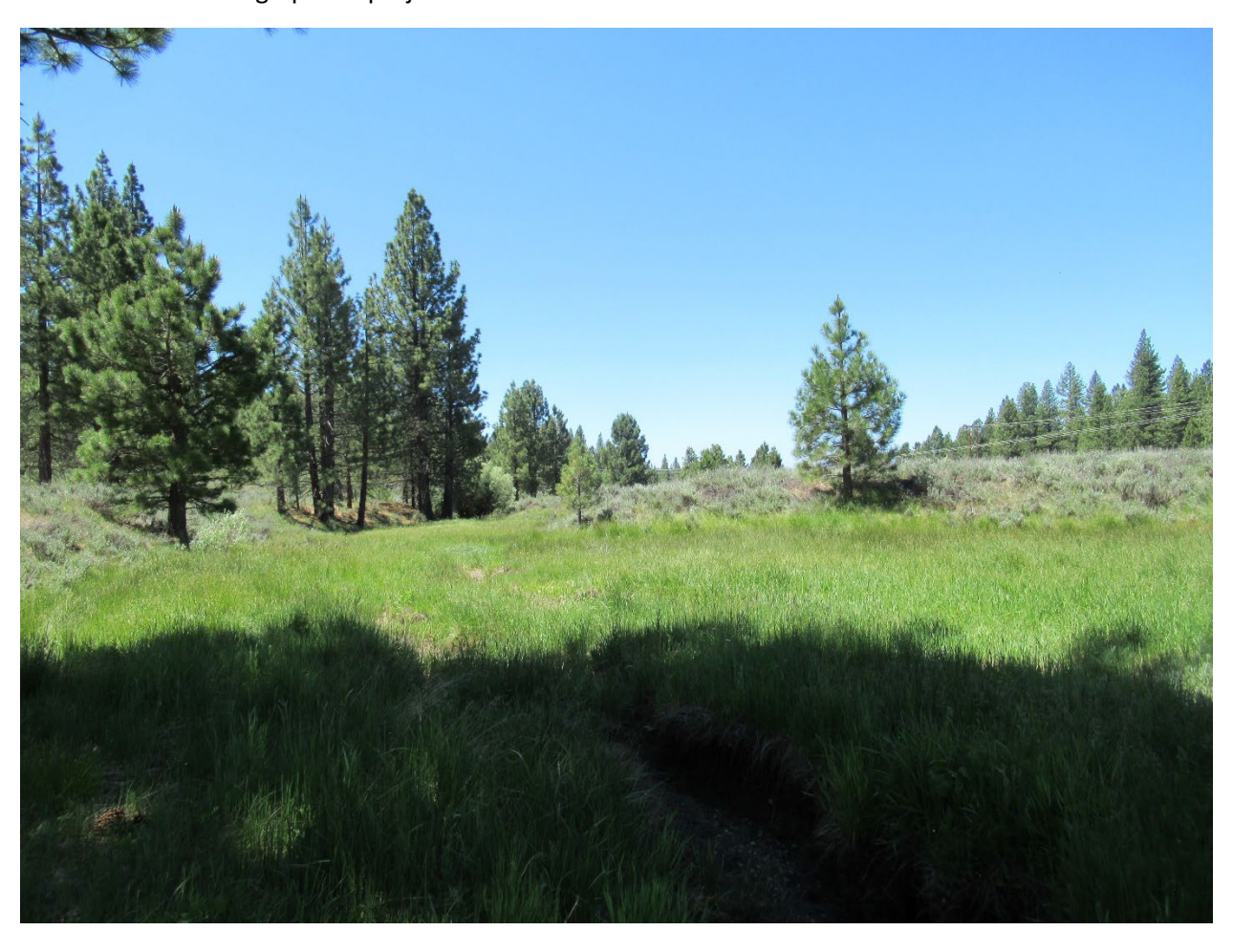
Portions of the existing channel support vigorous wet meadow vegetation.