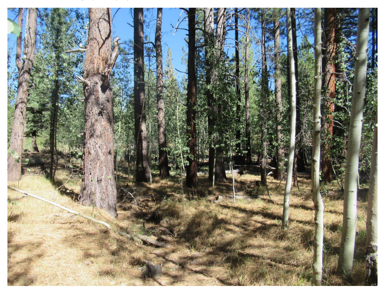
Aspen stand, and some evidence of past ditching. Aspen restoration is one of the objectives of the project.