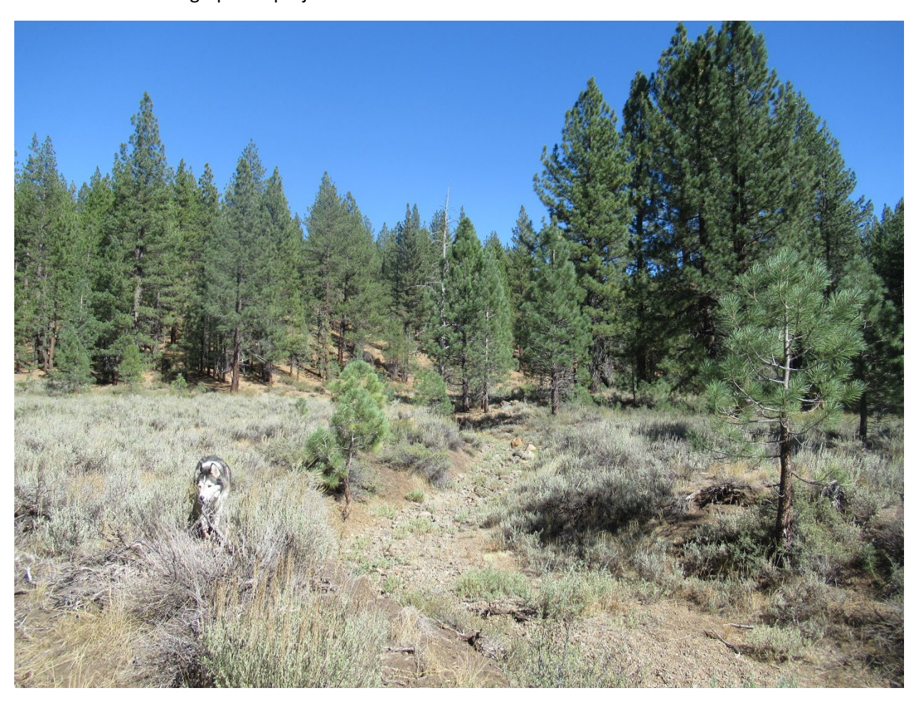
Tributary drainage near upstream end of meadow. Substantial sediment appears to come out of this drainage.