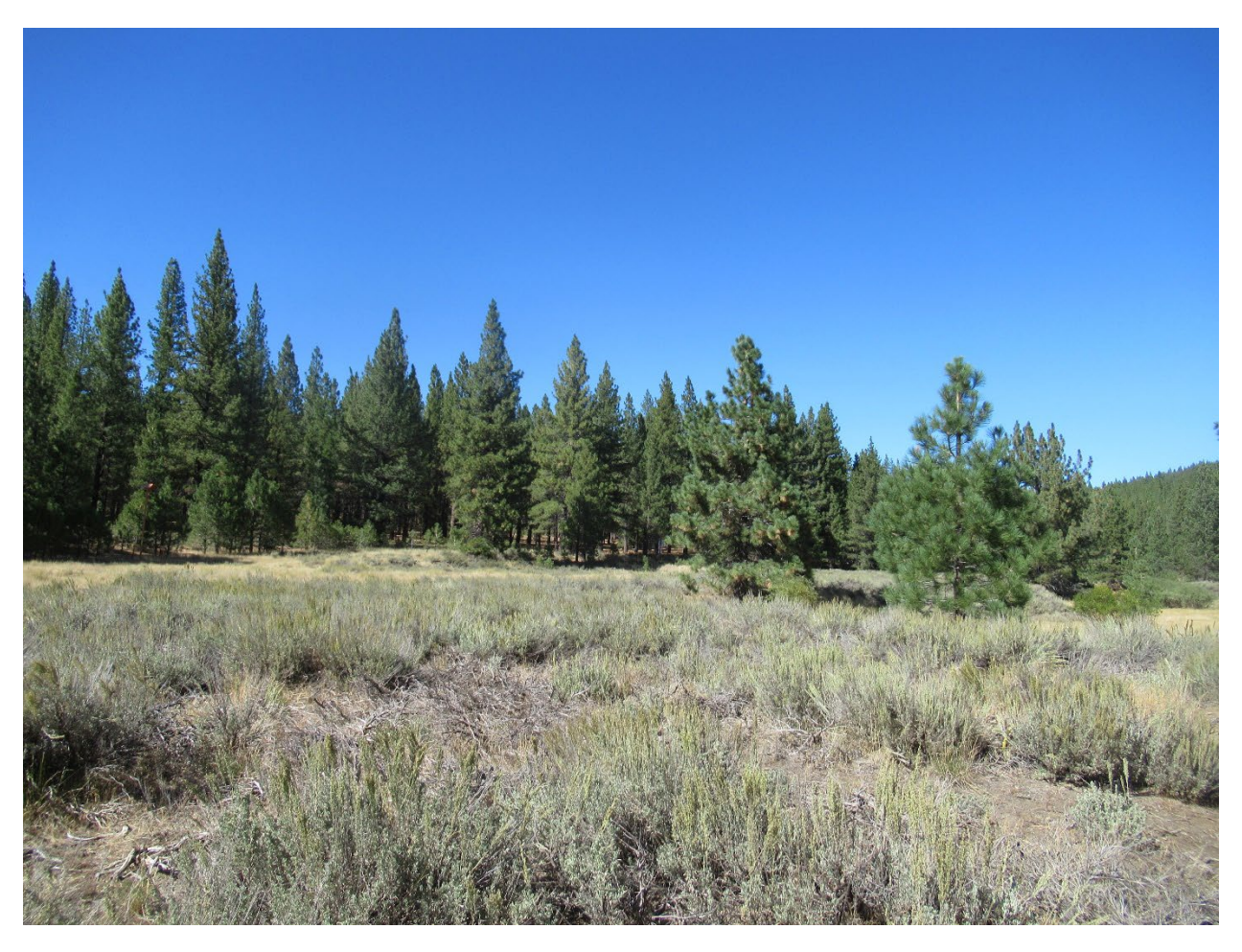
Dried out portion of meadow, disconnected from incised stream channel.