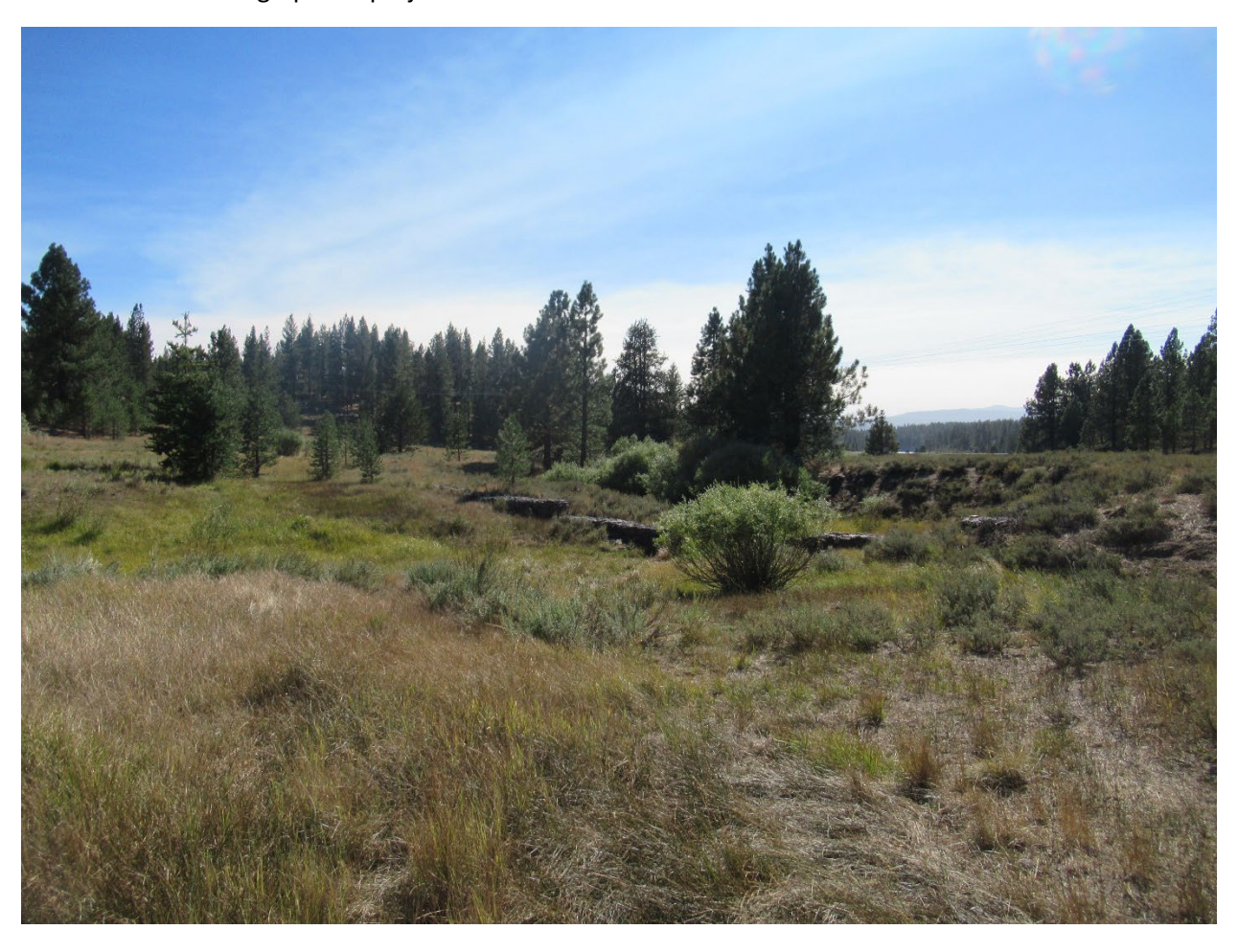
Existing stream channel. A series of rock and cyclone fence gabions were placed in the stream channel at some time in the past, possibly as a strategy to arrest erosion.