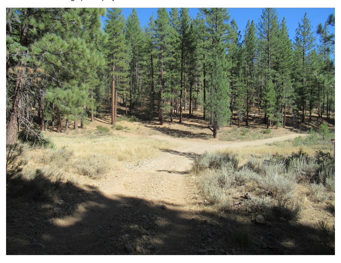
Road crossing near top of meadow on Forest Service Road 72.