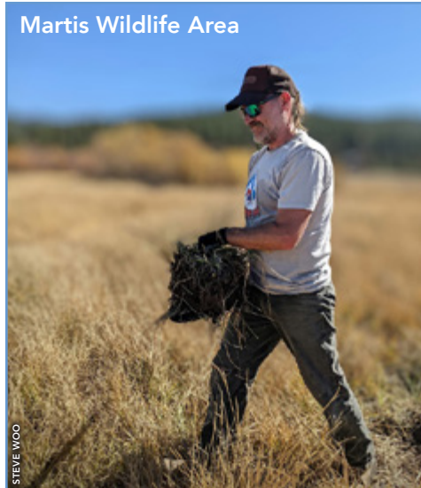
Martis Wildlife Area

In partnership with the Truckee Donner Land Trust, volunteers planted aspen trees to support diverse habitat at a popular trailhead.