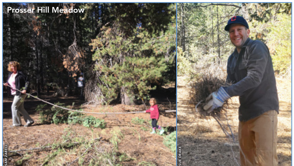
Prosser Hill Meadow

In partnership with the U.S. Forest Service – Tahoe National Forest, volunteers spread native seed, mulch, and slash to help protect a recently restored meadow.