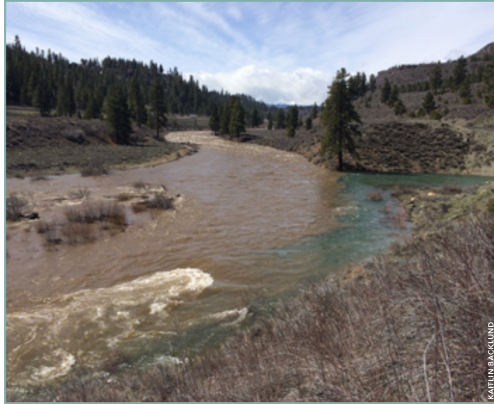
The main-stem of the Truckee River polluted by sediment at the confluence of the Little Truckee River near the California-Nevada state line.

Small changes in precipitation, ambient temperature, or managed stream flows could result in a cascade of degradation.