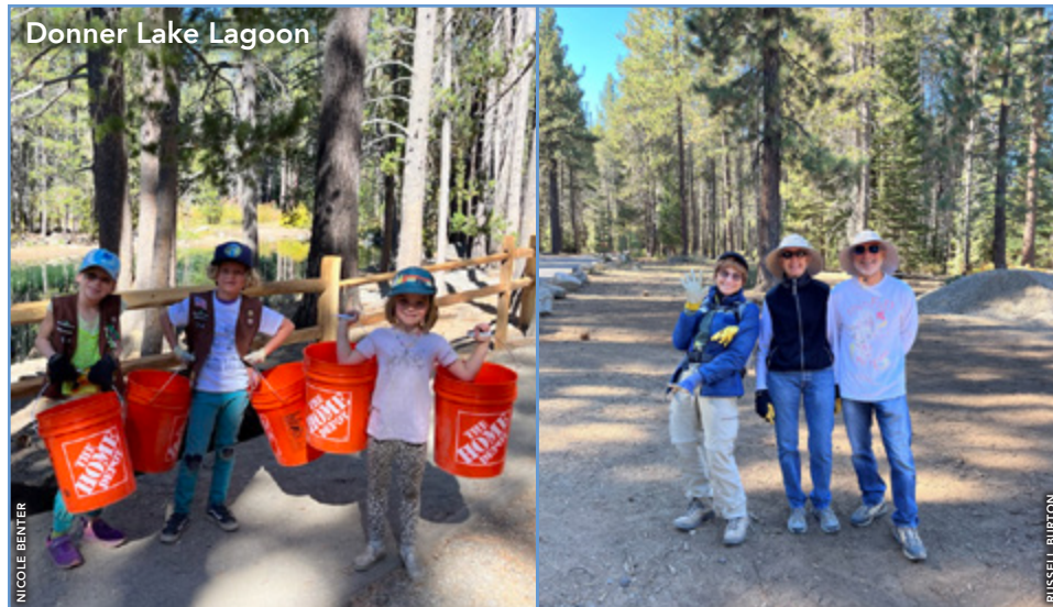
Donner Lake Lagoon