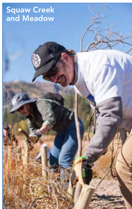
Squaw Creek and Meadow