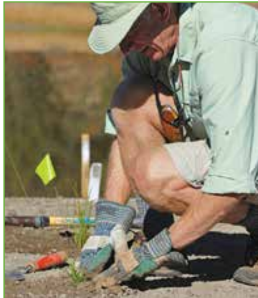
A volunteer plants vegetation at the Coldstream Ponds restoration site