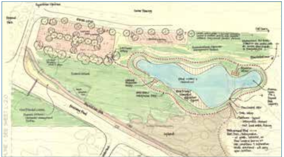
Truckee Wetlands Concept Plan

The diagram shows the conceptual design for the first phase of the project. In addition to restoring the wetland's soils, plants, surface and ground water connections, the project will include a walking path and interpretive signs.