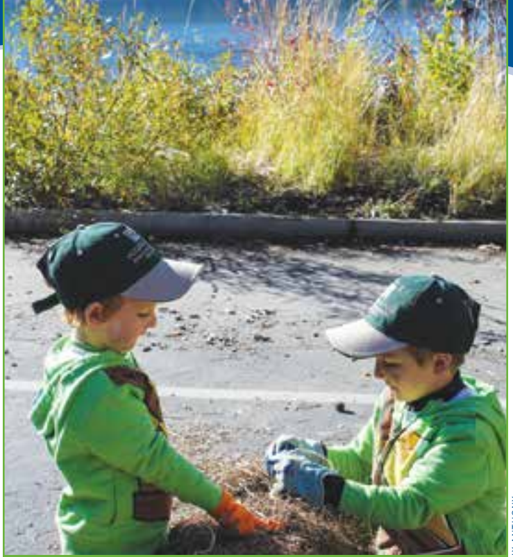
DONNER LAKE BOAT RAMP EROSION CONTROL

A trail segment between the Donner Camp and the Prosser Lakeview neighborhood was re-routed by the U.S. Forest Service and Truckee Trails Foundation. The abandoned trail segment ran right next to Alder Creek and was causing erosion problems. Volunteers closed the old trail by planting willows, seeding and mulching.