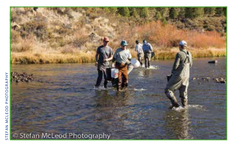
Volunteers place appropriately sized gravels in Prosser Creek to improve fish habitat.

Prosser Creek is an important spawning area for fish in the Truckee River watershed. However, Prosser Dam blocks the movement of critical material such as spawning gravel. On Truckee River Day a group of volunteers placed appropriately sized gravels in the streambed to improve habitat for fish. A group of volunteers from Trout Unlimited participated at this site.