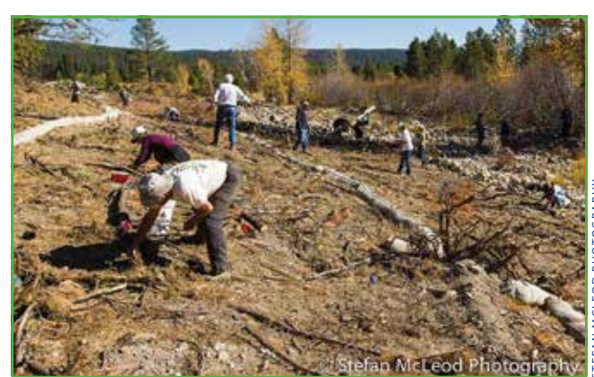
Volunteers at work in Coldstream Canyon on Truckee River Day.

In 2012, TRWC and California State Parks partnered on a major restoration project along Cold Creek in the lower reach of Coldstream Canyon. This section of creek was channelized many years ago to accommodate gravel mining. The channelization led to massive erosion in the constrained creek channel. The restoration project included creating nearly an acre