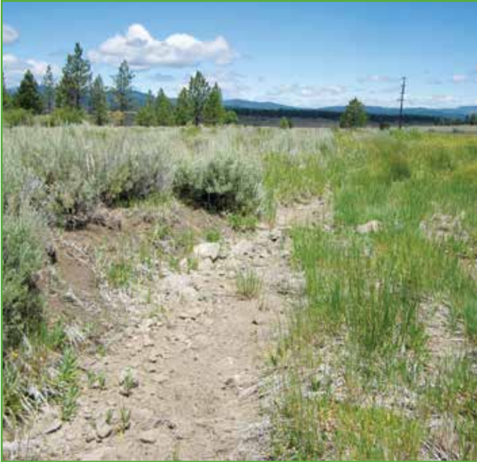
TRUCKEE RIVER WATERSHED COUNCIL

Restoration will reduce flood velocities, preventing further erosion near the Middle Martis Channel.