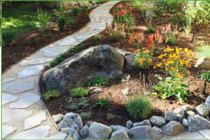
After: The homeowners have installed a permeable walkway, mulch, gravel, and vegetation to protect the previously bare soil. Water from the roof and uphill sources now stays on the property, soaking into the ground.